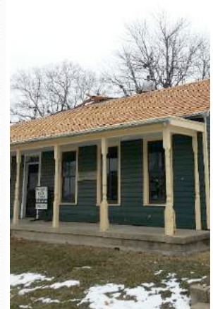
New cedar wood shingles.