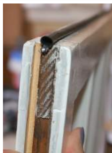
Slot for aluminum weather strip.