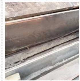
Hand lettered packing crate addressed to G.F. Stegeman found in floor joists of attic.

HISTORIC PELLA TRUST CELEBRATING 20 YEARS OF HELPING TO PRESERVE PELLA