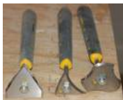
Heating Tool and Scrapers

He also made me a cool template which would help me drill the holes for the stop bead adjusters. The adjusters are the brass pieces in the stop bead.