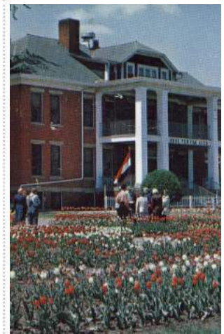
Fair Haven West & Gardens