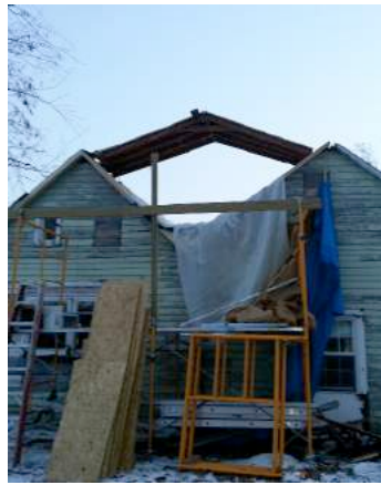
Peak of old roof is removed to return the roof line to its original style.