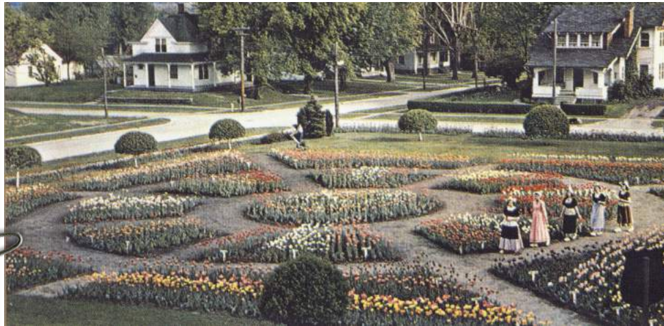
Fair Haven Memorial Tulip Garden in Full Bloom