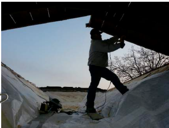
Back wall of 1110 Washington is opened up.