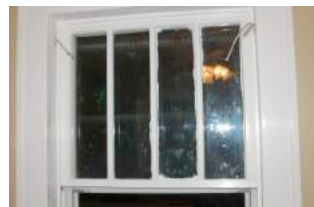
Parting stop and completed window.