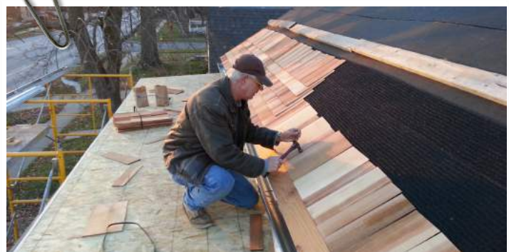
Beautiful cedar wood shingles added to Stegeman Store.

After the back wall of the attic was opened up and the peek removed, the new low slope roof was revealed. The low slope roof will channel the water to a scupper which will help with proper water flow. The final step was adding new cedar wood shingles to restore the building to its historical look. The bitter cold of the winter put further construction projects on hold, but watch this spring and summer for ongoing changes.