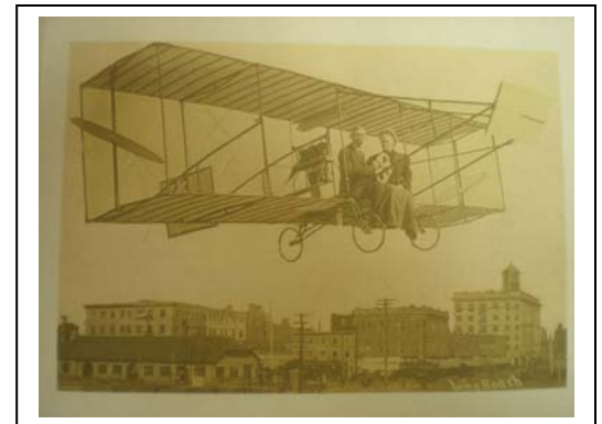
The above picture is of an aeroplane demonstration at a fair in Illinois in 1911. It would be this type of plane that the Pella Fair organizers were attempting to solicit for their October 3,4,5,& 6, 1911 fair.

A visit to the poultry house was worth while because there was an excellent showing of the various breeds and some fine birds were exhibited.