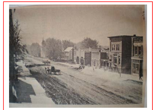
South Main St looking from the corner of Franklin and Main... You can see the tower of Third Reformed Church.