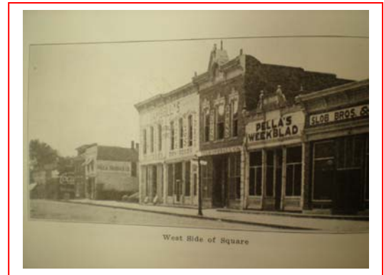
1911 Photo of the west side of the square.